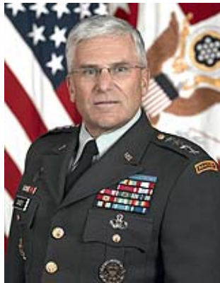
General George Casey Army Chief of Staff