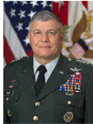
General Richard Cody Army Vice Chief of Staff